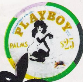
VEGAS STRIP: FRIDMAR DAMM/ZEEFA/CORBIS; L'ATELIER: COURTESY OF MGM MIRAGE; PLAYBOY, MANILOW AND LIBERACE: ERIN FITZGERALD

When it comes to drinking, sex, and other more serious vices, the celeb-frequented Palms (4321 West Flamingo Road, 866-942-7777, palms.com) is the devil's own hot spot. In addition to the thong-filled pool, in-house tattoo parlor and Hugh Hefner megasuites (we can't even imagine what goes on in a room that costs as much for a night as a Lexus), the Palms offers the 52nd-floor Playboy Club . Think expensive drinks, an insurmountable line, and impossibly proportioned—though not nude—waitresses. And if you think the view is good there, just head upstairs to the Moon nightclub's 53rd-floor roof deck.